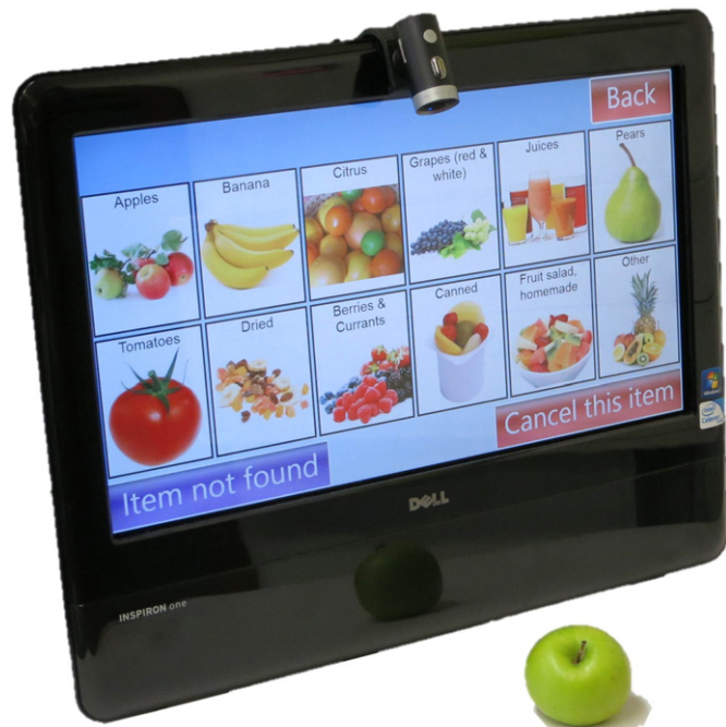
Fig. 2. NANA system showing nutrition data entry.

ageing (Deary et al., 2010) and the tasks developed for NANA were based on existing gold standard measures used in the assessment of cognitive function. The white square task was a simple measure of processing speed requiring participants to touch a white square as quickly