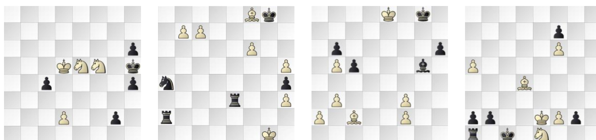
Figure 3. Four studies from Table 4: H01 (White to draw); V04, V05 and V16 (White to win).

Table 4 lists the 37 positions that van der Heijden and Vlasák chose. Authors are credited and serial numbers in the HHDBIV corpus are given. 7 The status of the positions vis-à-vis sub-8-man EGTs and FINALGEN is indicated. Some of these positions may contribute in part to a future, hypothetical test set TS3 .