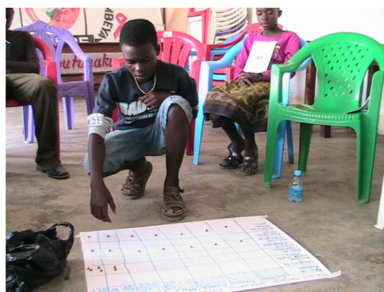
Figure 1 Young person completing participatory time-use exercise, Mbeya workshop

In the research on sibling caregiving in Tanzania and Uganda, my role in bringing different stakeholders together for participatory dissemination workshops reflected that of a 'mediator and conciliator' in Benequista and Wheeler's (2012) typology of the communicative roles of researchers. I considered that visual representations of young people's experiences and priorities could help to reinforce findings for policy and practice audiences. Quantitative data about young people's caring activities gathered through a time-use diagram could be quickly collated, presented and discussed with NGO staff and community leaders in the workshop the following day (see Figures 1 and 2). The quantitative evidence about the mean number of hours of care work that young people engaged in per week, disaggregated according to gender and position within the household, gave greater weight to my findings and helped to emphasise the significance of their care work for