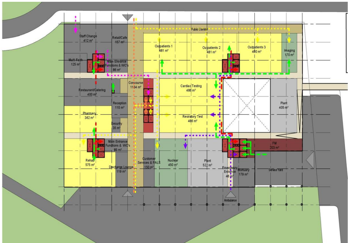
Figure 4: Vertical Flows schematic (image courtesy of HOK Architects)