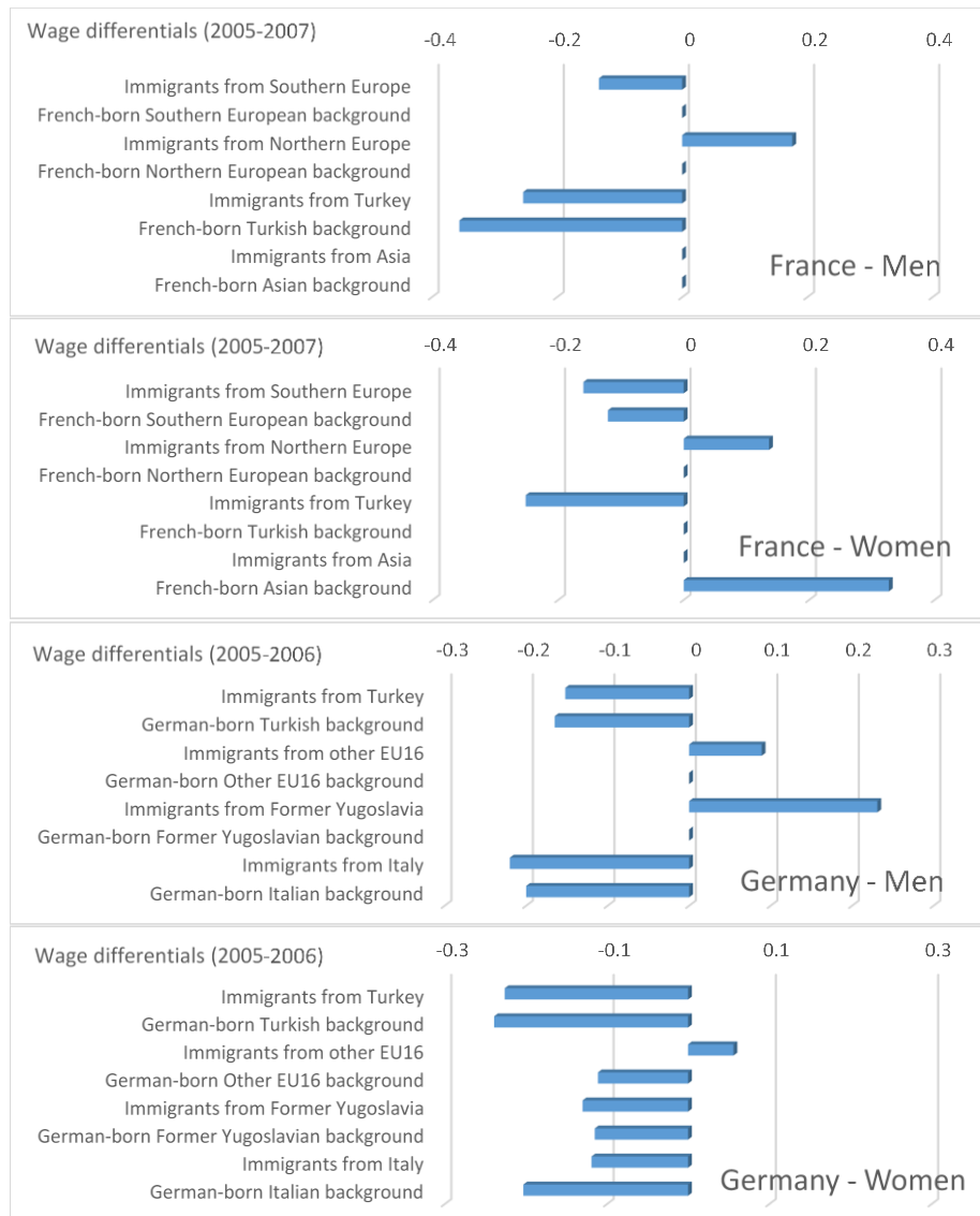
Figure 1: Racial and gender wage differentials in France and Germany