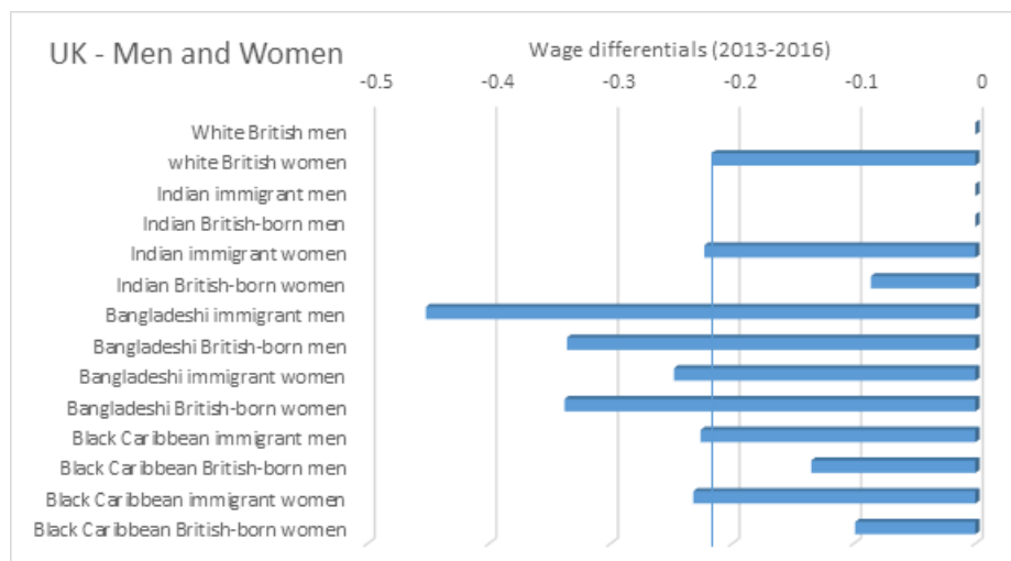
Figure 2: Racial and gender wage differentials in the UK (2013-2016)

Source: Author's calculation using UK Labour Force Survey 2013 (first quarter)-2016 (second quarter).