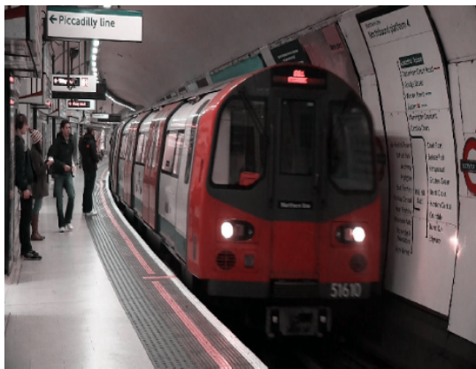
Figure 9. Colour blindness preset