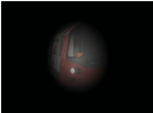
Figure 5. Pigmentosa preset.