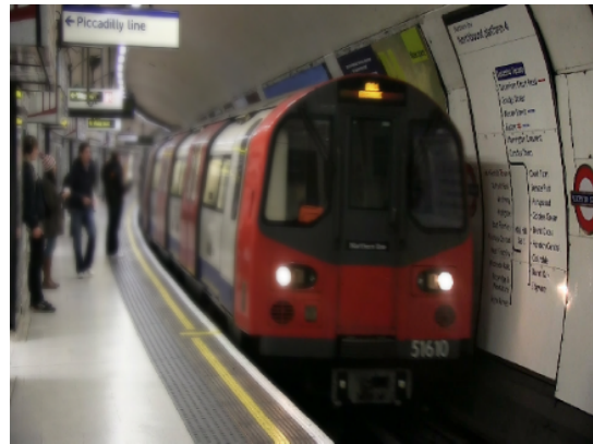
Figure 8. Myopia preset