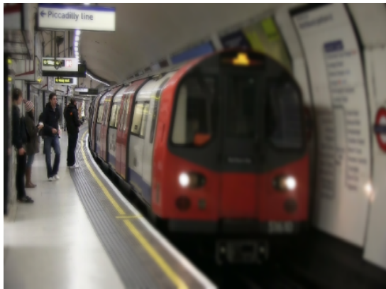
Figure 7. Hyperopia preset