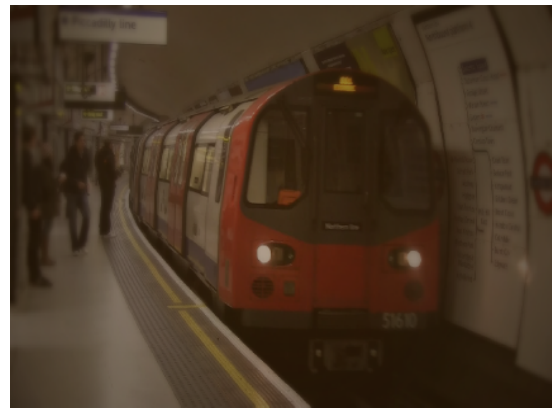
Figure 2. Cataract preset.