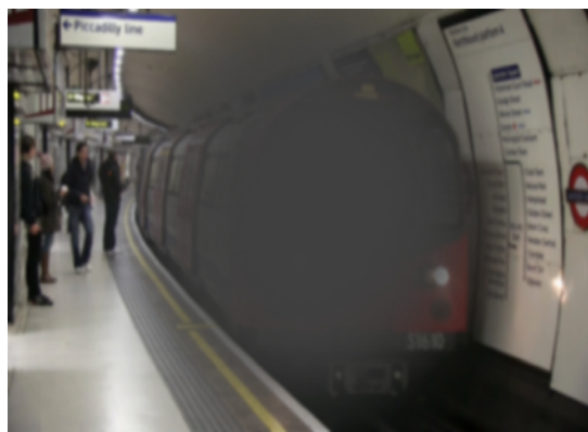
Figure 6. Macular degeneration preset.