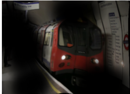
Figure 4. Retinopathy preset