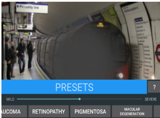
Figure 1. Presets menu.