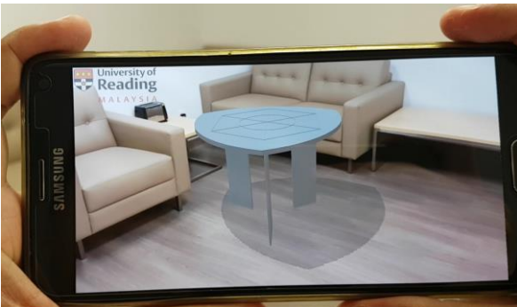
Fig. 3. Geometry only model.