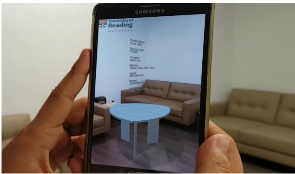
Fig. 2. Geometry with 2D info model.