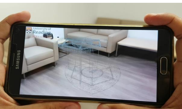
Fig. 4. Wire frame model.