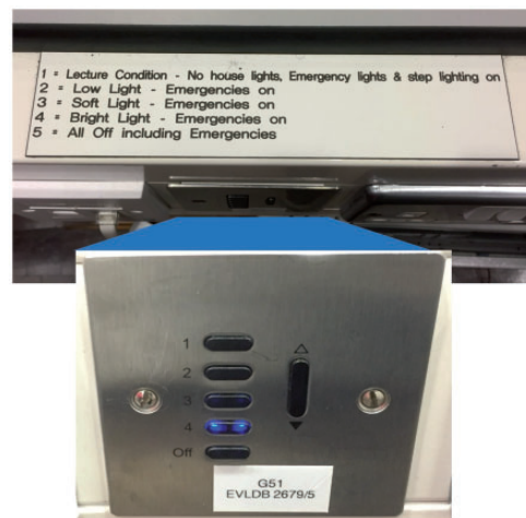
Figure 2 Chemistry lecture theatre light switch

Participant 5: 'It's really quite important, especially as I tend to use video clips and other tools in my lectures that I can