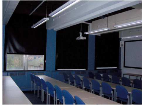
Figure 3 Classroom used for lunchtime research seminars in the School of the Built Environment

Participant 1: 'So I mean it's horrible for lots of reasons, one of them being there's no sense of connection with the outdoors. Now if your lectures stimulating enough