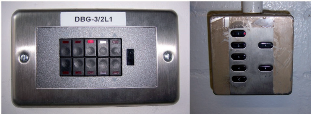
Figure 4 Two specific examples of poor classroom light switches that were explicitly mentioned in relation to participant's difficulty using the controls

the classroom and then they all go off and it's a nice distraction and people find it funny, but realistically this digital light switch thing is a nonsense, because even though I've been here two and a half years I've never actually been shown how to use these switches properly' [Expert in the built environment, academic]