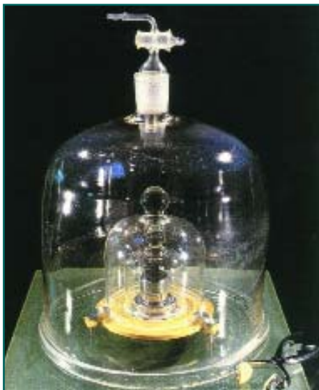
The kilogram, kept by the Bureau International des Poids et Mesures.

The present situation is that relative mass measurements within either the field of macroscopic or microscopic masses can be made with very much higher precision than that with which we are able to compare masses between the two fields. For example, it is possible to compare the mass of two kilogram artifacts,