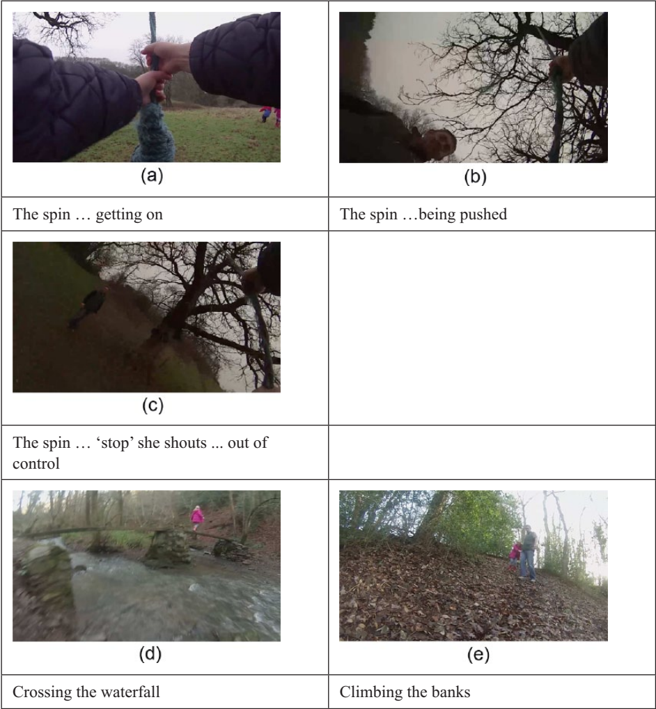
Figure 3a-e. Exploring the woods with dad.