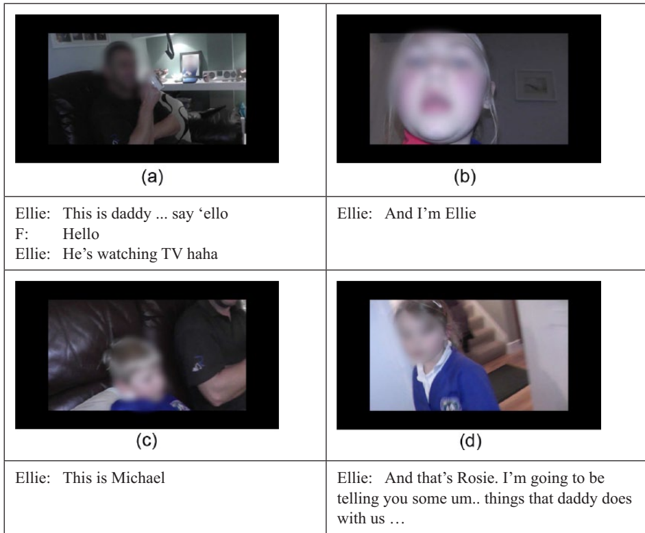
Figure 2a-d. The older sibling as filmmaker.

We hold onto the trees ... This bit you have to hold on because it is really slopey.