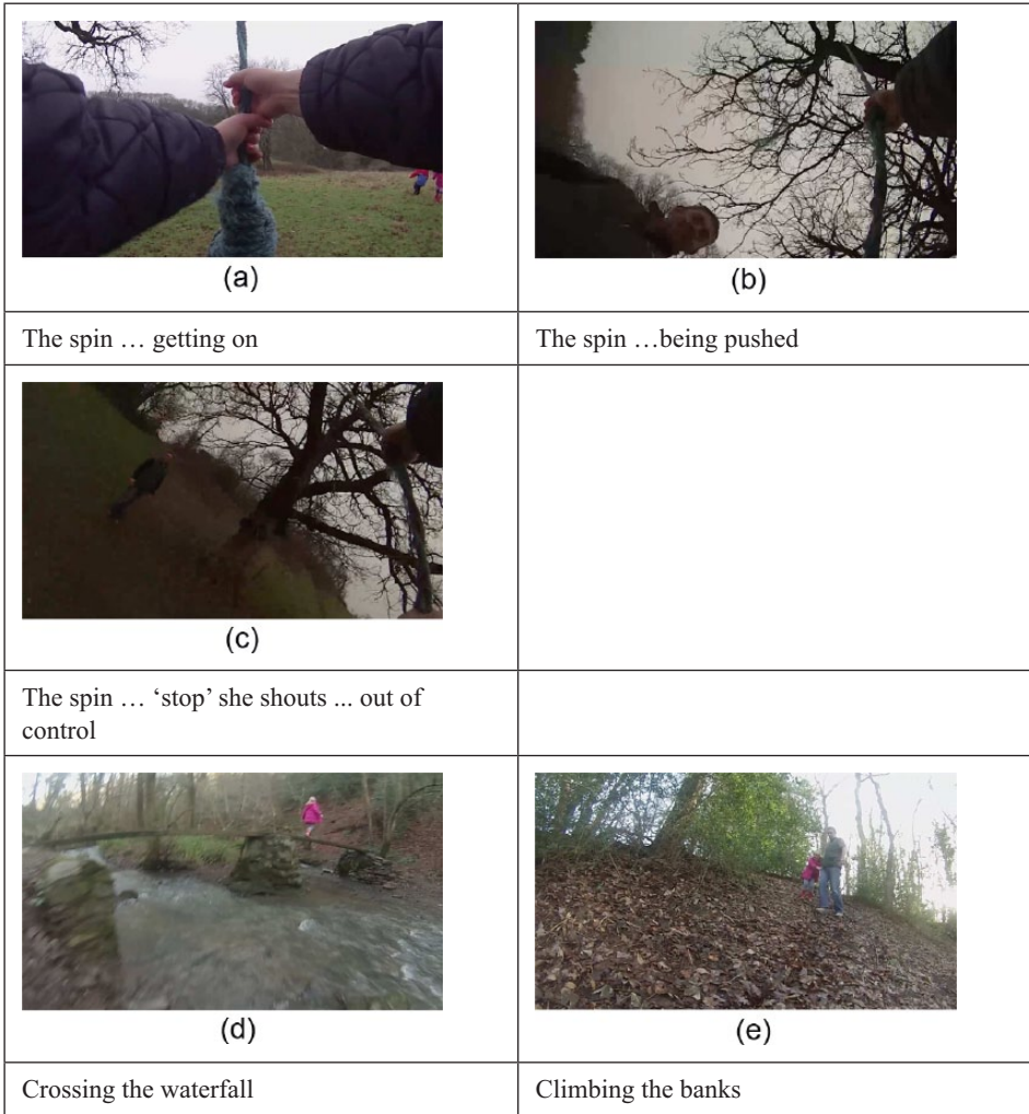
Figure 3a-e. Exploring the woods with dad.