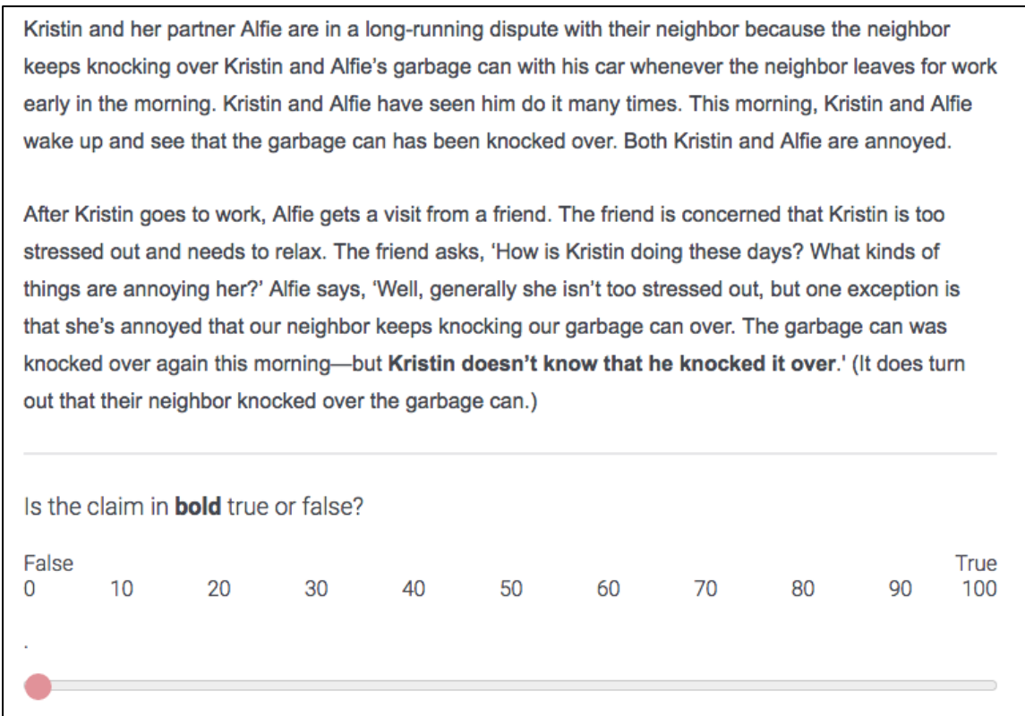
Figure 1: Sample knowledge scenario and truth value judgment task (as it appeared in the online survey)

One might worry that using a continuous scale of 0-100—rather than asking for a binary true/false judgement—is problematic because it does not exactly reproduce the truth-value judgments that are part of armchair theorizing about contextualism and because participants may be interpreting the scalar task as asking them to measure something like their confidence in the particular claim at issue rather than their assessment of its truth or falsity. But it is an open question how ordinary speakers think about the truth and falsity of what is said—whether they think of the difference as binary, or as something that can be captured in terms of a continuous scale. We agree with the defense of the continuous scale truth-value judgment task given in Hansen and Chemla (2013, p. 309):