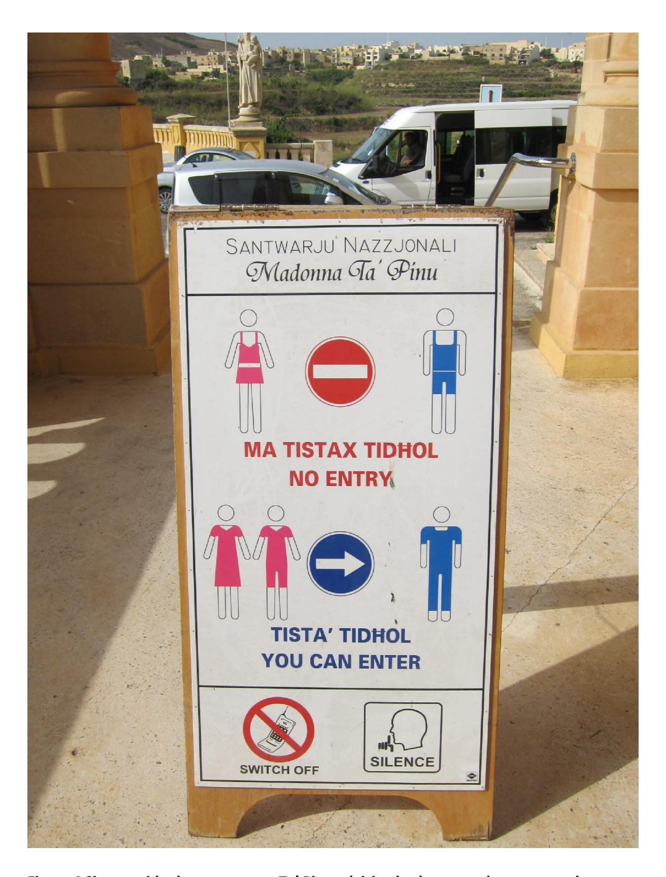
Figure 4 Sign outside the entrance to Ta' Pinu advising both men and women on the shrine's dress code