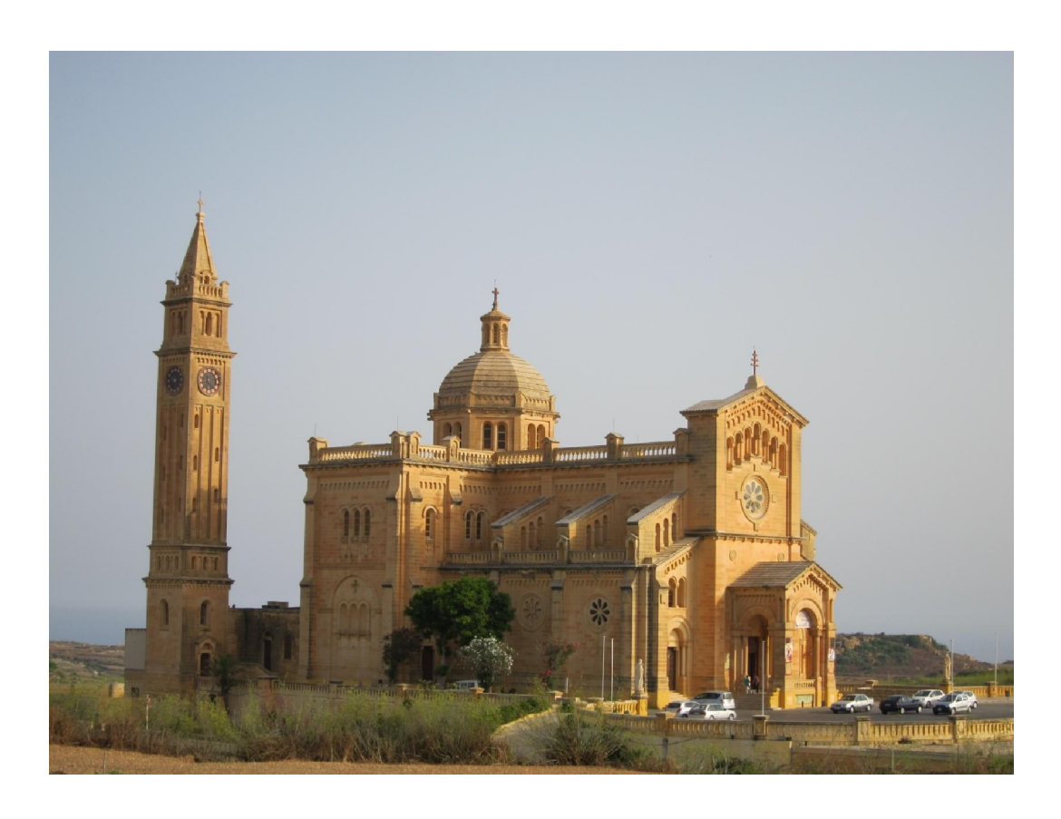
Figure 1 Ta' Pinu shrine, Gozo, Malta