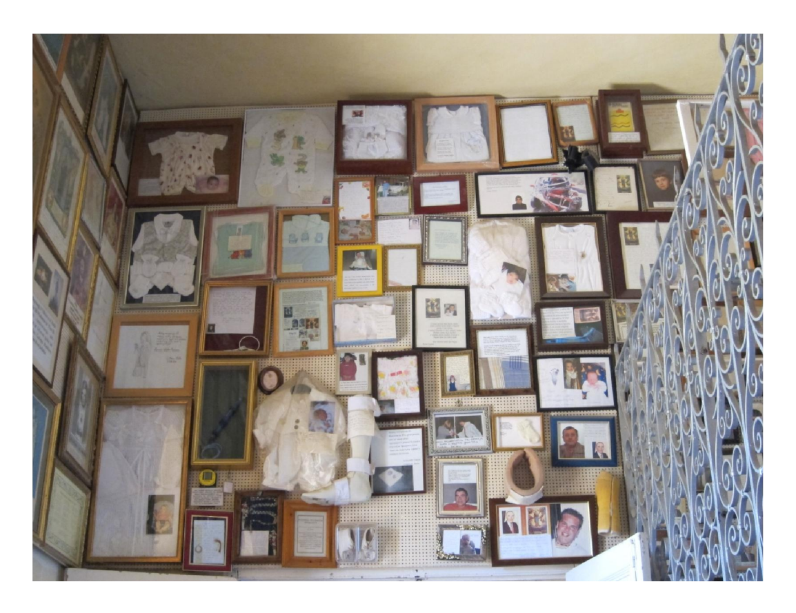
Figure 2 Ex votos at Ta' Pinu (note baby clothes and medical equipment)