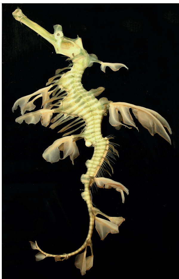
Figure 4. The leafy sea dragon Phycodurus equus (Günther, 1865) REDCZ-COLE3206.

it was when I set eyes on it for the very first time more than 40 or so years ago " (Cowper, 2007). (Figure 4).