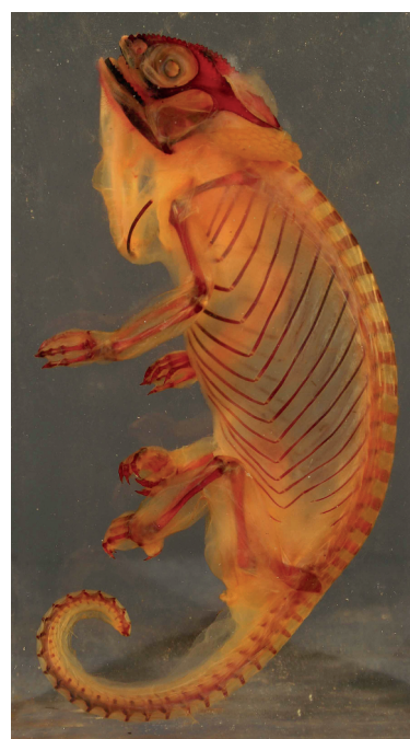
Figure 5. Chameleon preparation REDCZ-COLE2962.