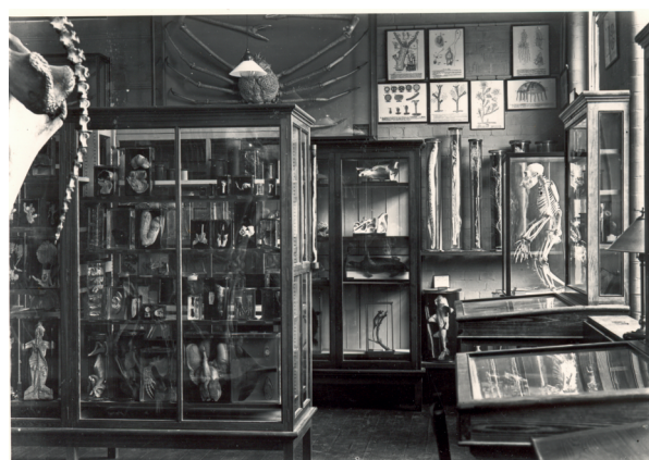
Figure 6. The Cole Museum at the London Road site.

The Museum was originally based on the London Road campus of the University (Figure 6). After Cole's retirement in 1939, space was an issue. After a delay due to the outbreak of World War II, a new zoology building was completed at the London Road site, with basements that could double as air-raid shelters. The aforementioned 1956 Nature article on Professor Cole and his Museum noted that the Museum was housed in an inadequate building, stating that "it is greatly to be hoped that on the new University site..." (the Whiteknights campus purchased in 1946) "...a worthy building will be planned" , and also that the University would make sure that it maintained "what is a unique asset, not only for the University of Reading, but also for the entire country" (Anon., 1956).