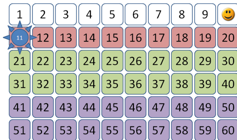
Figure 1 PowerPoint for EI in adults

Procedure. The procedure in EI tasks is very straightforward: the sentences are read and learners have to try to repeat each sentence verbatim. To be able to analyse each grammatical structure separately, it is advisable to include 4-6 different sentences for each sentence type. For experimental purposes, it is useful to pre-record the sentences, so all learners can listen to the sentences in exactly the same way in terms of the speaker's voice, intonation, speed of presentation, and loudness. This can be done by playing the pre-recorded sentences from a CD/DVD/MP3 player/tablet or by incorporating the pre-recorded sentence into a PowerPoint presentation. The latter also enables the inclusion of visual support, so participants are aware of the length of the task, as shown in Figure 1 below.