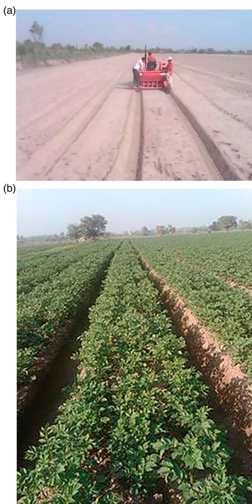
Figure 8. On left, mechanized making of raised beds and furrows on laser-leveled field in Punjab province of Pakistan; on right, SCI carrots being grown on raised beds.

and for weeding can all be hired out to small farmers on an economical basis. Forming permanent beds by tractor on laser-leveled fields can be done in a few hours, for example, and once formed they will improve agriculture operations and productivity for many years. With appropriate institutional arrangements such as custom service companies, mechanized SCI can be made profitable for farming at different scales of operation, although not for very small holdings where using tractors is not practical.