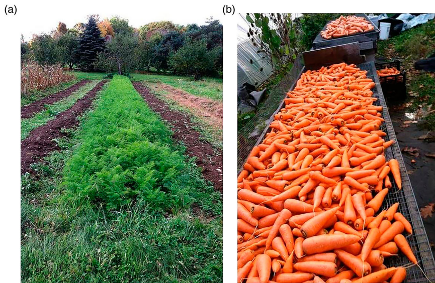
Figure 7. SCI carrot bed, on left, and harvest, on right, at Teltane Farm, Monroe, Maine, USA, 2014.

broadcasted square metre of land. This is a yield equivalent to 3 tonnes/ha.