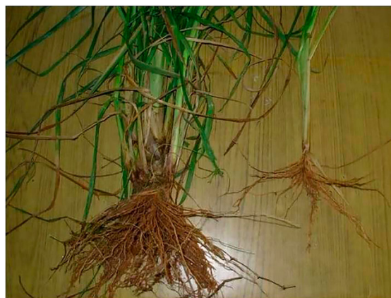
Figure 2. Comparison of the root systems of finger millet plants grown in Jharkhand state of India; SFMI methods on left, and conventional methods on right.

plants which are cultivated with SRI practices. These results were, however, unfortunately never published ( Figure 3 ).