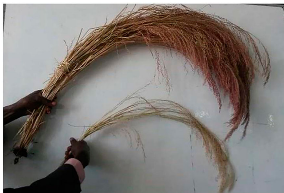
Figure 5. Comparison of tef panicles growing from a single plant: the top panicle was grown with TIRR methods, and the bottom panicle with standard broadcasting methods.

ATA reported that in 2014/2015, 2.2 million farmers were using TIRR methods, one-third of the total number of tef farmers in Ethiopia, on 1.1 million ha. The average TIRR yields of 2.8 tonnes/ha were 75% higher than produced with traditional methods,