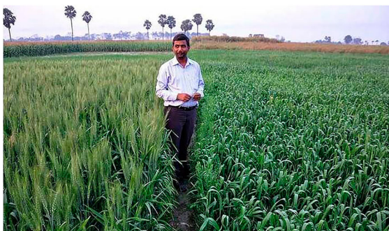
Figure 4. Adjacent wheat fields planted at the same time in Chandrapura village, Khagaria district, Bihar state, India, in 2012. The SWI wheat field on left matured earlier than the traditionally-managed field on right. SWI crop panicles had already emerged while the crop grown with standard methods was still in its vegetative stage.

guidance made further increases in yield, averaging 4.6 tonnes/ha instead of 2 tonnes/ha (PRADAN, 2012a). Beneficial crop responses to the new methods were easily seen (Figure 4). The Jeevika programme reported that average SWI yield increases in 2012 were 72%, with households' net income/ha from wheat production raised by 86% under SWI (Behera et al., 2013). By 2016, an estimated 500,000 farmers were using SWI methods in Bihar covering about 300,000 ha, with yields of 4–5 tonnes/ha representing an average increase of 60–80%.