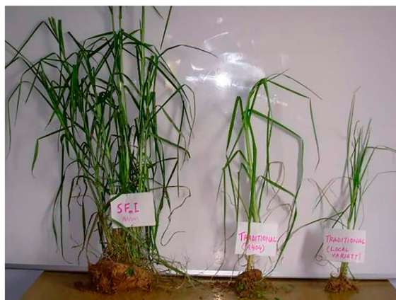
Figure 1. Finger millet plants grown with different methods in Jharkhand state of India, 2006 season. On left is a plant of improved variety (A404) grown with adapted SRI methods, including transplanting of young seedlings; in the centre is a plant of the same improved variety grown with farmers' usual broadcasting methods; on right is a local variety grown with these same traditional broadcasting methods.

Researchers at the state agricultural university in Andhra Pradesh (ANGRAU) had previously evaluated the effect that transplanting finger millet seedlings at a young age had on root growth. Two improved varieties were transplanted as seedlings when 10, 15, and 21 days old, respectively, and their roots were compared at 60 days after transplanting. Their results showed that finger millet plants have a root-growth response to the transplanting of young seedlings that parallels what has been observed with rice