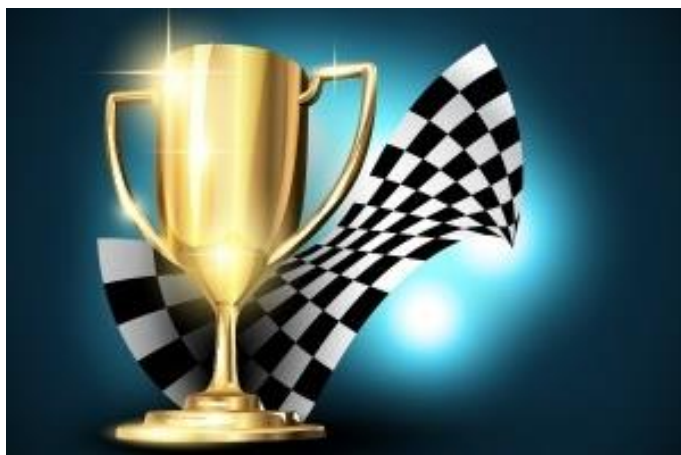
Fig. 7. The TCEC Cup, to be inscribed.