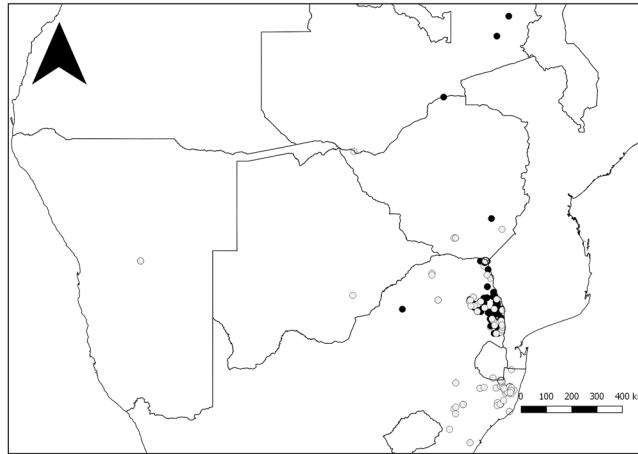
Figure 1. Map showing the locations of all re-sightings of African white-backed vultures tagged in this study. The black and grey circles represent individuals that were originally tagged in the Greater Kruger National Park and KwaZulu-Natal regions, respectively. The number of birds tagged in each region in each year is presented to Table S1. This map was created in Quantum GIS (Quantum GIS Development Team (2016). Quantum GIS Geographic Information System. Open Source Geospatial Foundation Project. http://qgis.osgeo.org ).

bird species being traded in Africa 19 . Although the exact methods used to trap vultures for such traditional markets are not known, at least some of them would have been poisoned 20 .