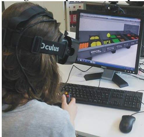
Figure 5: Experimental setup

Finally, we will seek your opinion on the offer of fresh fruits and vegetables in this “Super U”’s shop.