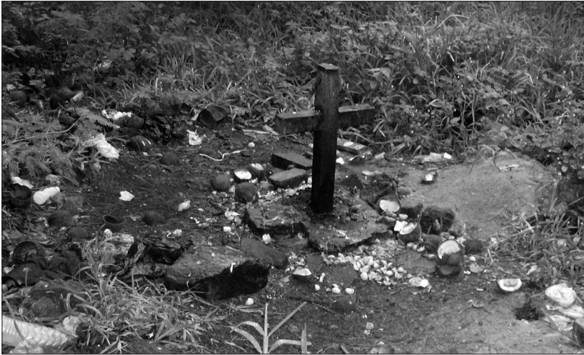
FIGURE 9.3. Remains of Longanis rituals practiced at Bois Marchand cemetery, by the cross at the former train station (a), and in Le Morne cemetery (b).