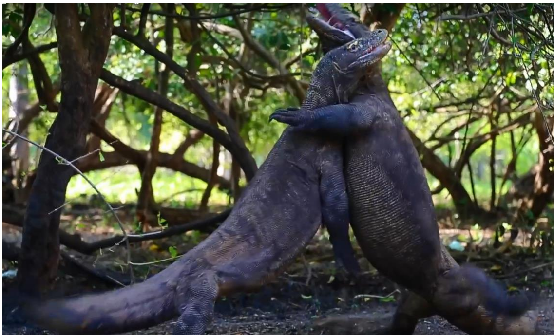
Fig. 2. Two Komodo dragons head-to-head: fighting, not foreplay. Ringside seats still available.

after 28. ... Rbd8 . Enter the dragons, KOMODO and KOMODOMCTS, over-hungry after the delay and more than ready for a fight, see Fig. 2. After much effort, the upstart newcomer overturned the seeding even more than HOUDINI, its win in the last of the eight scheduled games allowing no response.