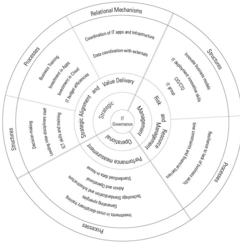
Figure 1: The three domains and six mechanisms of the IT governance framework