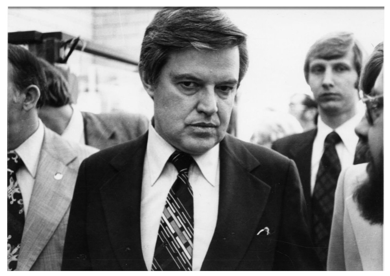
Figure 3: Committee Chairman Senator Frank Church (D-ID).

and 1974. This committee identified the growth of the national security state through presidential power authorised by the existence of four declared states of emergency that were still in effect.<sup>78</sup>