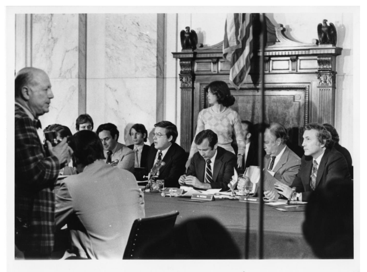
Figure 5: The Church Committee's public hearings.

stated that the committee's task was not to place the bureau on trial but to 'illuminate the policies and practices of our domestic intelligence agencies.' Tower also indicated that holding the public hearings into the FBI's activities would establish a 'complete record and an informed public' and as a result 'assist the committee in its difficult task of evaluating the important intelligence work done by the FBI.'<sup>121</sup> For a number of years, rumours and unsubstantiated stories had been spread of purported misdemeanours and illegalities conducted by the FBI. The five days of public hearings swept aside any doubt that the FBI had been operating both beyond its remit, and beyond the law. In addition, the hearings revealed that the victims of the unwarranted and illegal surveillance stretched from leading political activists, such as Martin Luther King Jr., to those that took part and organised anti-Vietnam War protests. The activities of the bureau were described by the committee in its final report as 'a betrayal of the public trust in the integrity of the FBI.'<sup>122</sup>