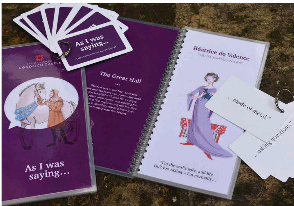
Figure 5. 'As I was saying', interpretation.