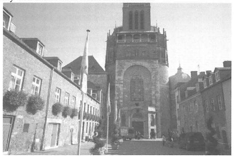
Figure 3: The site of the atrium of Aachen Cathedral. The Carolingian masonry of the westwork extends just above the great niche. The three-light window in the niche is later, as is the porch in which the bronze doors are now installed. The relic-display gallery is visible above the niche. The buildings at the sides of the atrium are almost wholly modern, apart from some surviving Carolingian masonry in the north-east corner, but they reflect the original form of the space which is known from excavation. For a convincing reconstruction of the original Carolingian form see Charles B. McClendon, The Origins of Medieval Architecture: Building in Europe, A.D. 600-900 (New Haven and London: Yale University Press, 2005), pp. 117-18. (Copyright author).

assembled in the atrium, a ritual repeated every seven years, at any rate from the day before Charles IV's coronation in 1349.