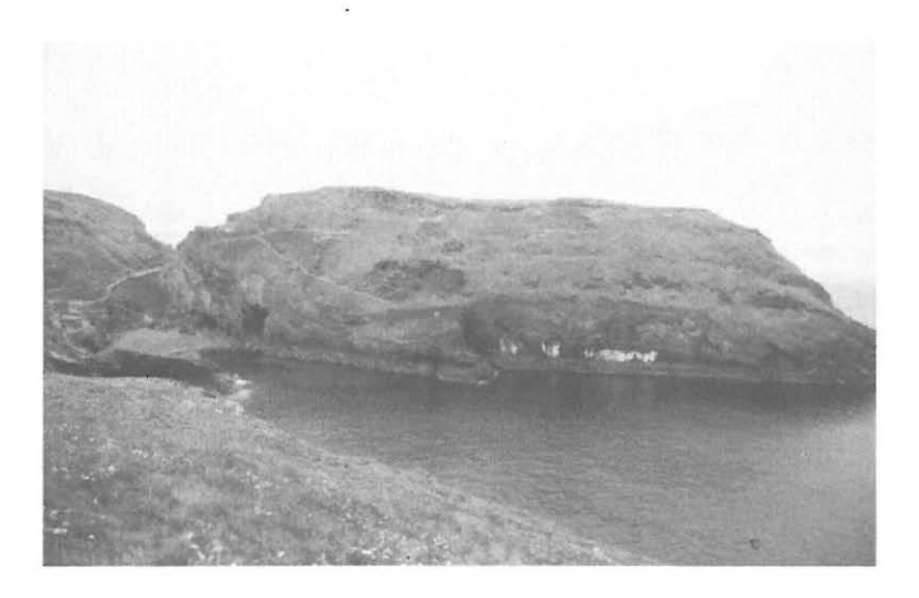
Figure 1: The promontory of Tintagel from the east across the Haven. The sharp nick in the skyline on the left-hand side of the photograph is where the saddle of rock once existed but has now collapsed. The 'island courtyard' of the castle is visible just to the right of it, while the 'lower mainland courtyard' is on the summit on the left of the photograph. (Copyright author).

Geoffrey of Monmouth's description of Tintagel, as put into the mouth of one of Uther Pendragon's followers, corresponded with the site as it actually existed, suggesting that Geoffrey knew it at first hand: 'That fortress is surrounded by sea on three sides, and there is no means of access other than a narrow This would have made it possible for Richard of Cornwall, his entourage, and perhaps his important guests vividly to envisage the events described by Geoffrey of Monmouth as they looked at the newly built castle. Maybe they were even able to play out the Arthurian legends, in the same sort of way as the Little Castle was probably used at the great seventeenth-century house of Bolsover. As Mark Girouard comments, 'its mock fortifications, vaulted rooms, carved chimney-pieces and statue of Venus at the centre of a crenellated garden enclosure' make it 'essentially a more solid version of the pasteboard castles that were erected as part of the entertainments put on to celebrate royal events',7 entertainments which may well have included enactments of Arthurian legends.