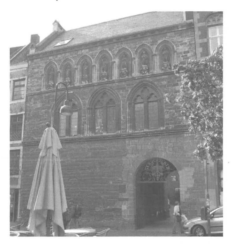
Figure 4: The Aachen Grashaus in the Fischmarkt, built in 1267. Now housing the city-archives, it was the town-hall before the restoration of the ancient Carolingian aula for this purpose in the late fourteenth century. It is heavily restored and the statues of the seven electors are modern replacements of statues known from early drawings.

city archives.<sup>58</sup> This was a magnificent building, decorated with statues of the seven electors of the king of the Romans (figure 4), so that Richard's part in it may have been another aspect of his policy of elevating Aachen's status as a coronation-city.