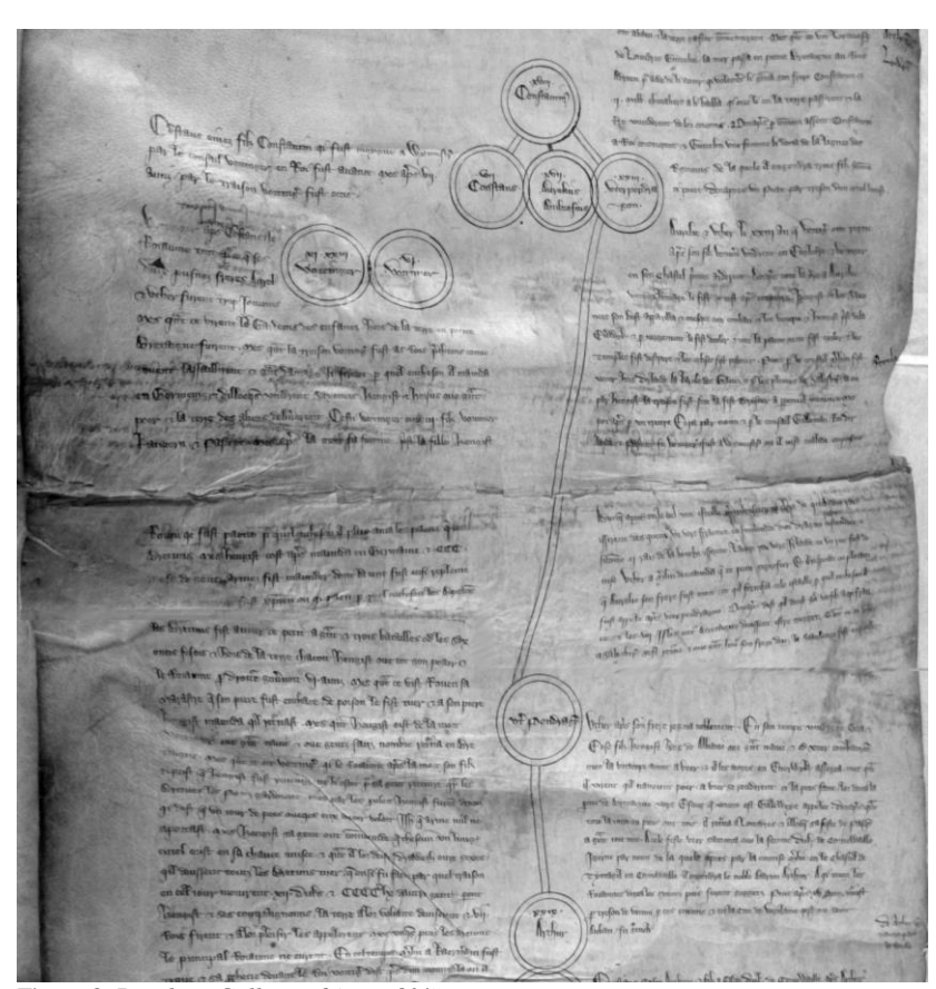
Figure 3: London, College of Arms 20/5