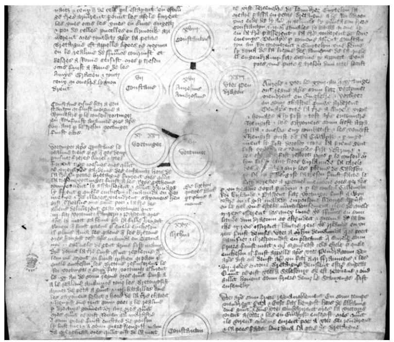
Figure 2: London, BL, Add. 8101

The Anglo-Norman genealogical rolls of the kings of Britain also stress the positive consequence of the adultery -the birth of Arthur. Oxford, Bodleian, Add. E 14 (early 14th c.)47 offers a synthetic but comprehensive summary: it evokes Uther's rapture for Ygerne, the circumstances of the duke's departure and the siege of Tintagel. Merlin's 'art' allows for the illegitimate conception of Arthur (whose name is introduced by two positive terms: '[Uther] parjut la cuntesse, si engendra le noble beer Arthur'); Gorlois' death finally enables the king to marry Ygerne. In this roll, the genealogy is structured on the right side by a diagram executed in red and brown ink containing the names of the successive British kings, with the commentary on the left side. Arthur features in two roundels, a double-entry system already set up by Matthew Paris and used above for King Constans. It is a common feature of genealogical rolls to represent twice the same character, first as son of a king, and then as sovereign, as if the acquisition of the royal dignity presented him with a new persona.