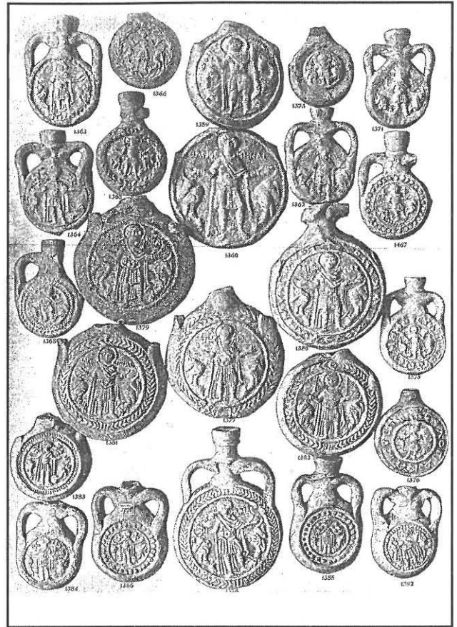
Fig. 1b Variety of ampullae from Abu Mina. From Oskar Wulff, Altchristliche und mittelalterliche byzantinische und italienische Bildwerke, Teil I: Altchristliche Bildwerke (Berlin, 1909) Pl. LXVIII