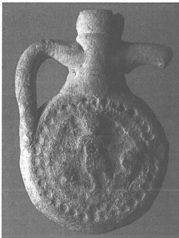
Fig. 4 Ampulla found at Meols (Photo David Griffiths, Grosvenor Museum Inv. No. 43.M.56, Chester)

The find of a Menas ampulla does of course not prove that a person from Britain went on pilgrimage to Abu Mina and came back with an ampulla. This could have been the case, but ampullae might also have been traded, as was other objects from the East, perhaps as amulets. The ampullae do confirm the possibility of transport of an object from the area of Alexandria to Britain.