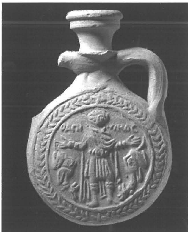
Fig. 1a Menas ampulla, 153 x 105 mm. (Bangert (Oxford, forthcoming) cat no 1).

Until 1906, it was known only from documentary sources and the ampullae. The first excavations began at the hill, locally known from the many ampullae found there. Excavations have now taken place continuously since the 1960s, mainly by the German institute in Cairo, and apart from the pottery the site is very well published. 3