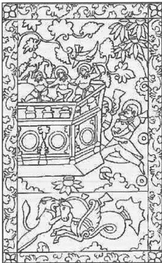
Fig. 2. Panel from Sui dynasty sarcophagus, said to depict the Byzantine Empire. Note vine-scroll and figures trampling grapes in a vineyard (After Shaanxi Archaeological Institute, 2001).

consciously adapted to specifically Chinese cultural norms or was misinterpreted as a circus motif.