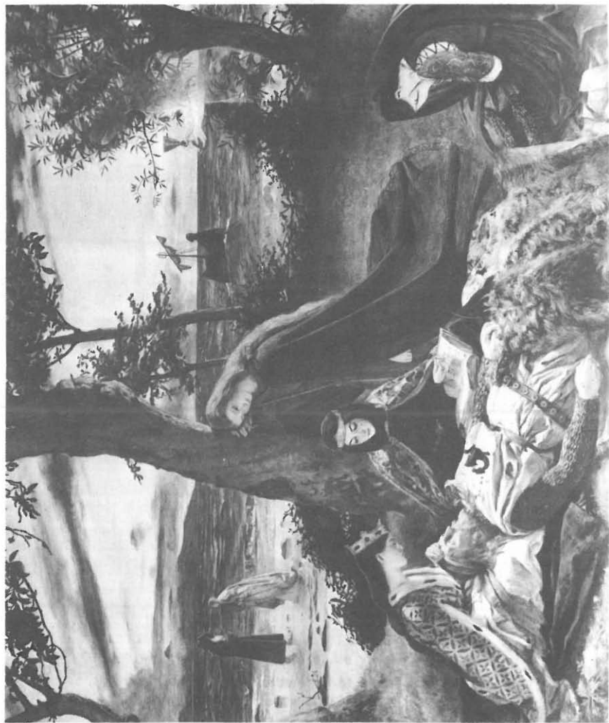
Fig.6 The Tennysonian Arthur: La Mort d'Arthur , by James G. Archer.