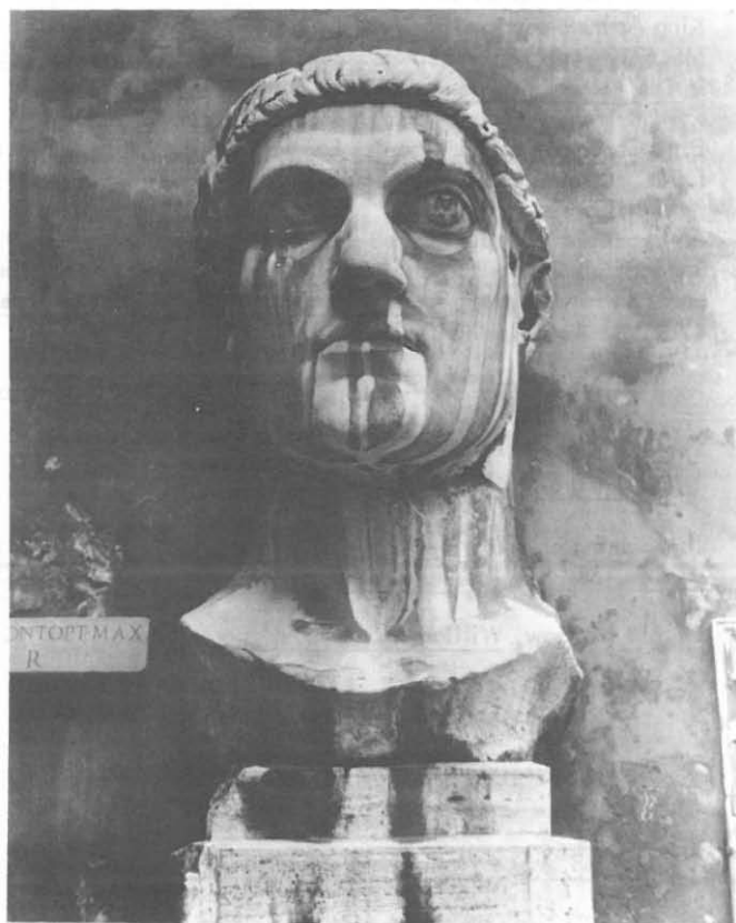
Fig.1 Constantine. 'The Sacred Countenance'