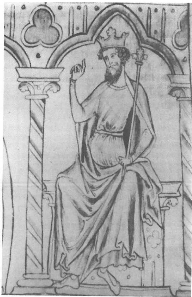
Fig.2 Vortigern, as a conventional medieval king.