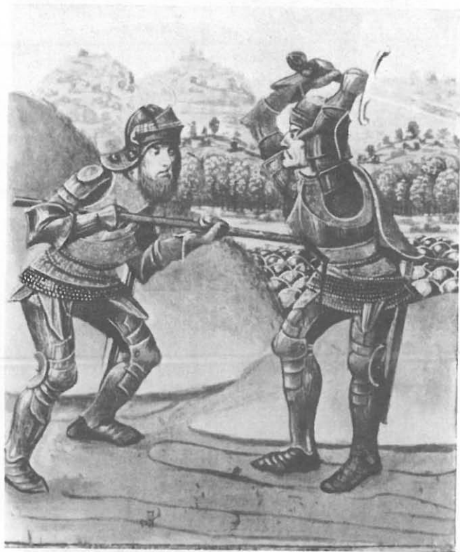
Fig.5 Arthur and Modred in mortal combat, c.1480.