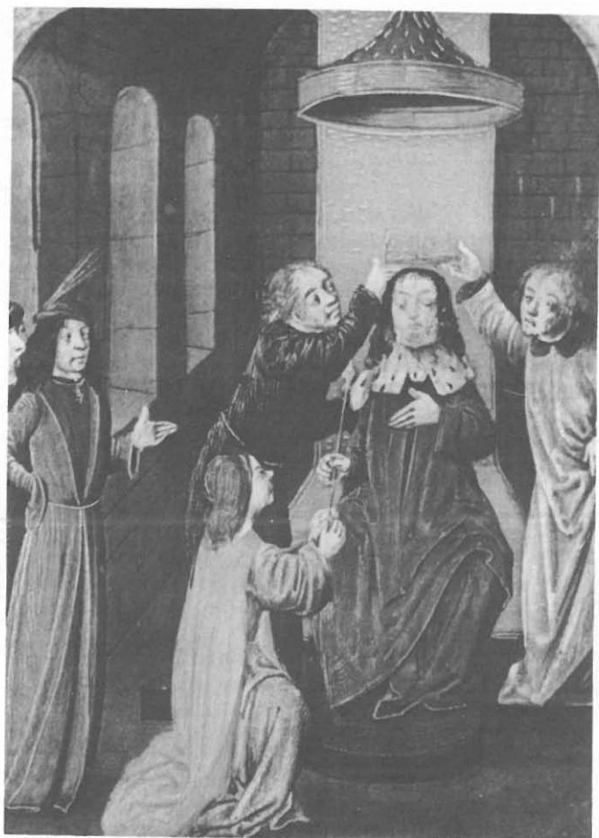
Fig.4 The Coronation of Arthur, as imagined by a fifteenth-century painter of the French/Flemish school.