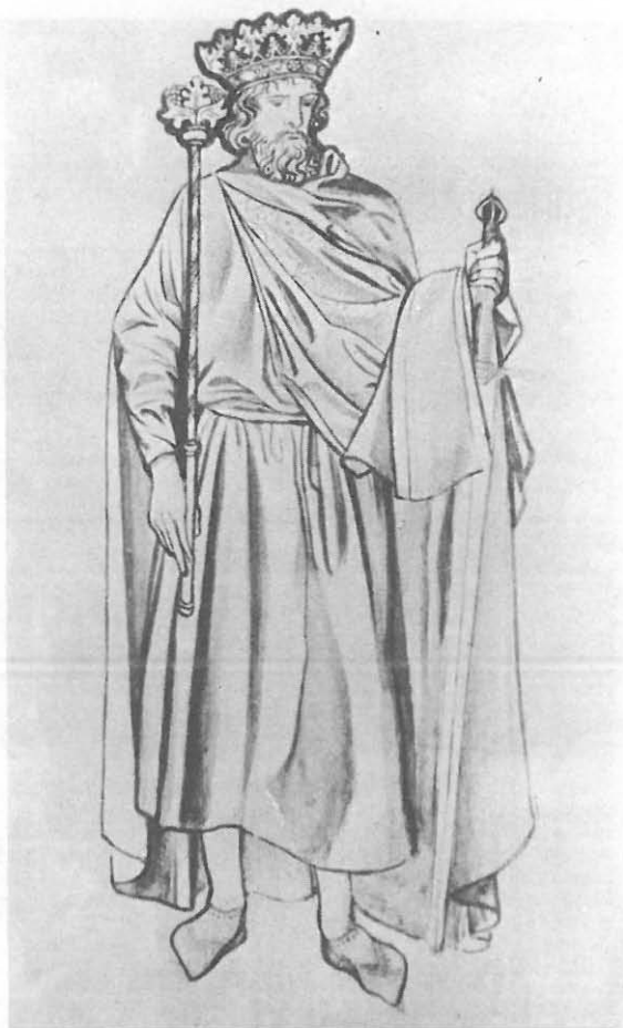
Fig. 7 The return to the medieval image: King Arthur, by William Morris.

(The Editors regret that they were unable to trace the copyright holder of this photograph.)