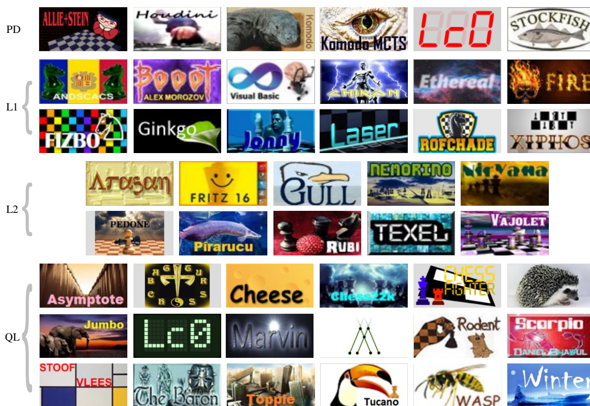
Fig. 1. Logos for the TCEC 16 engines (CPW, 2019) as in their original leagues and divisions.

TCEC Season 16 started on July 14 th 2019 with a revised structure as active engine authors are forming a longer queue to join the action. ‘Divisions’ are now ‘leagues’: divisions 4 and 3 were replaced by a larger Qualification League. Leagues 1 and 2 with 16-18 engines were double the size of their predecessors. Fig. 1 and Table 1 provide the logos and details on the enlarged field of 46 engines. Elo figures seem to be getting higher but it is of course only the Elo differences that are significant.