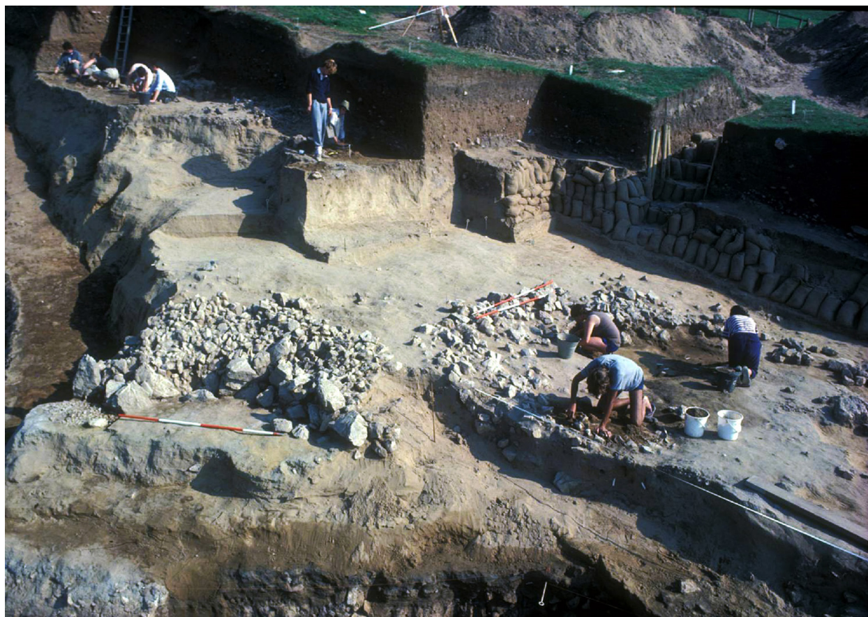
Figure 15.1: Brean Down excavation 1985: Middle Bronze Age settlement Unit 5b roundhouses stratified in a sand dune sequence.

In planning the Brean project, the work of Charles Thomas and his colleagues at Gwithian was very much in our minds. In many respects those expectations, based on Gwithian, were realized. Five phases of occupation, Beaker (2 phases), biconical urn, Trevisker and Late Bronze Age were separated by episodes of sand deposition and colluvial (slope) sedimentation. As at Gwithian, the sand deposition phases were blankets covering the site and represented phases when the sites were unoccupied.