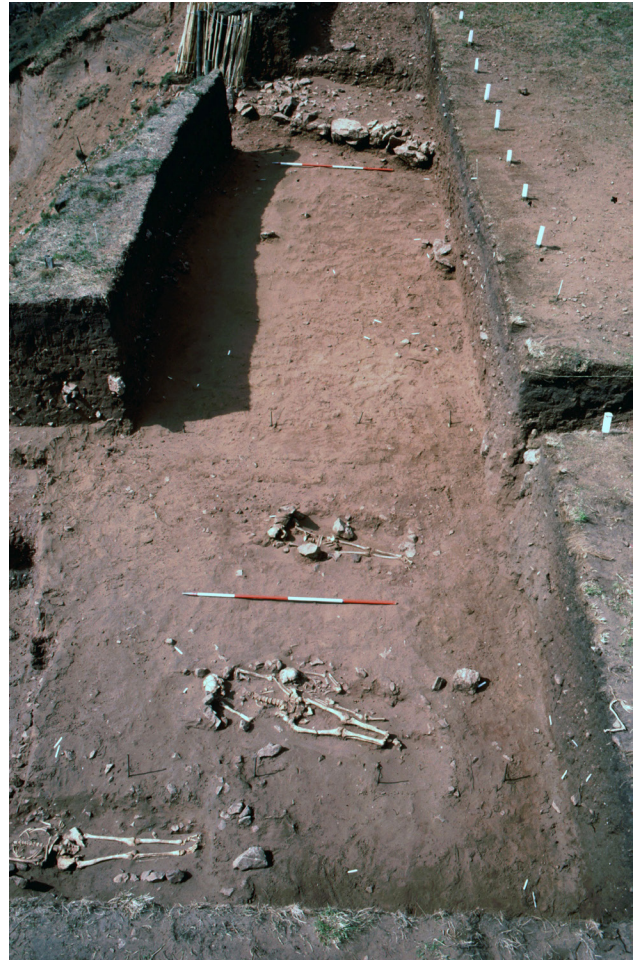
Figure 15.2: Brean Down excavation 1989: field wall on colluvial Unit 4a, the surface of which shows indistinct linear ploughmarks along the contour. In the foreground are burials of a post-Roman cemetery.

In other respects Brean turned out rather differently from expectations based on Gwithian. I had expected a more significant arable element to the economy brought about perhaps by the possibility of using the resources of the seashore, shell sand, seaweed and so on, to form man-made soils, of which there was evidence at Gwithian as Straker and Walker note in their chapter. This was an interest of mine following excavations in Sussex where we had found evidence for the use of seaweed in this way (Bell 1981b). In the event we found some charred seaweed. Micromorphological evidence and the evidence for two distinct colluvial phases indicates arable activity but only during two phases. The plant macrofossil evidence for arable was quite limited (Straker 1990). The only field boundary and ard marks were on the upper colluvial soil post-dating the latest Bronze Age occupation (Bell 1991; 1992). The economy of Bronze Age Brean seems to have had a pastoral emphasis based on the vast tract of saltmarsh at the seaward edge of the Somerset Levels. Two recent scientific studies have strengthened the case for this. Organic residues on the Trevisker pottery show it was used in the processing of dairy products (Copley et al 2005). The other study used isotopic analysis of animal teeth at Brean and Welsh Severn Estuary sites to demonstrate that they had grazed part of the year on saltmarsh (Britton et al 2008; Britton & Müldner 2013).