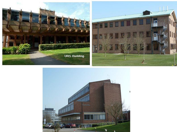
Figure 1. Surveyed buildings.

The surveyed buildings were located on the Whiteknights campus of the University of Reading. All of them were south-north orientation, of brick-concrete structure, single-glazed with aluminium alloy frames and non-air-conditioned with heating supplied in winter. Figure 1 demonstrates the façades of the surveyed buildings.