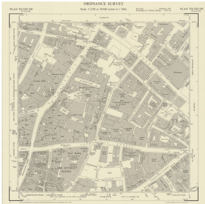
Figure 4 Ordnance Survey Map 1951 TQ 3381.

Therefore, it was both failing to keep up with its competitors in terms of organic growth and remaining the smallest of the “Big Five.” 36