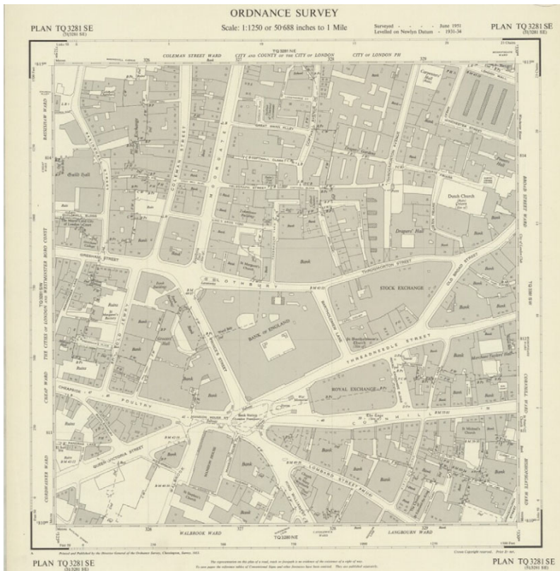
Figure 3 Ordnance Survey Map 1951 TQ 3281.