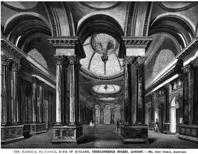
Figure 1 The banking hall (The Builder, 1865, 835).

banks since Soane.” 28 Ward-Jackson summarizes Gibson Hall as follows: “This, the most extravagant of the City’s Victorian joint stock banks, makes its mark principally through the profusion of its sculptural adornments.” 29