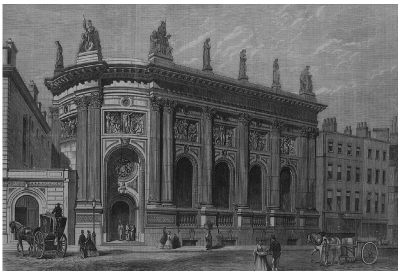
Figure 2 National Provincial Bank of England, at the corner of Threadneedle-Street and Bishopsgate-Street. (Illustrated London News, January 20 1866, 57).

marble pillars, would have eased the doubts of even the most neurotic depositors.” 32