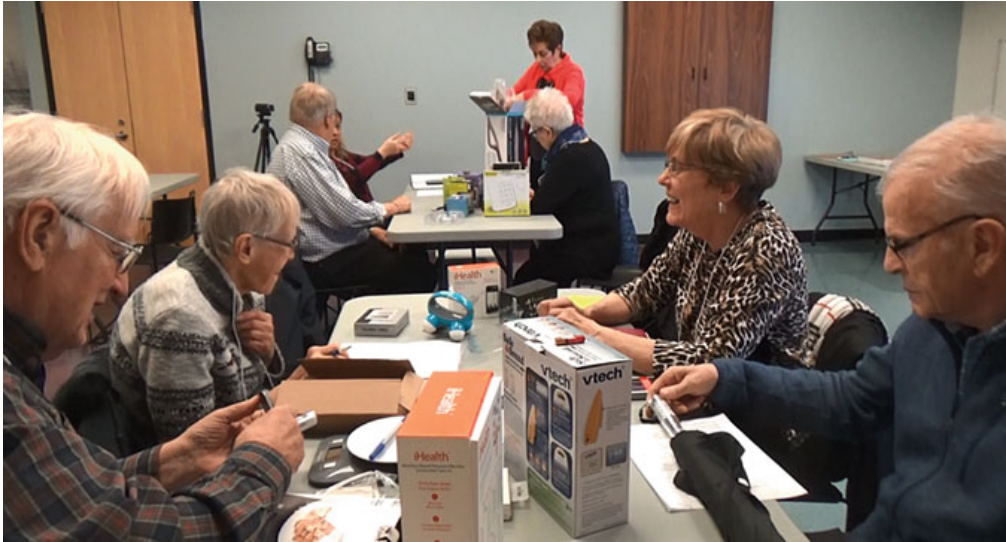
Fig. 11.2 Technology Interaction session