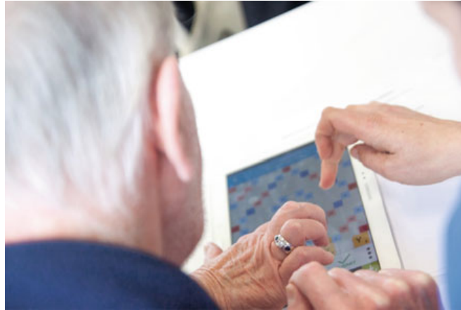
Fig. 11.4 Leisure apps

et al. 2019). In response to these discussions, it was decided that DataDay would be developed primarily as a tablet-based application, although smartphone use would also be possible.