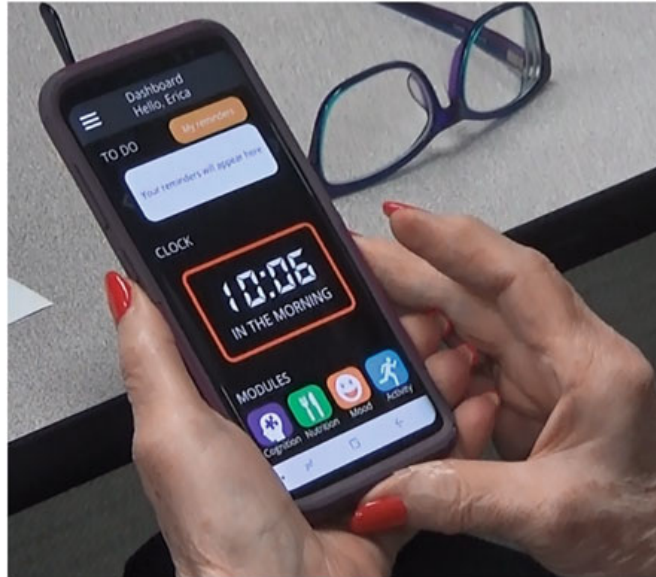
Fig. 11.5 Interacting with DataDay prototype

role in older adult's technology adoption decisions (Astell et al. 2019). This highlights the multidimensional and complex decision-making process that older users of technology undertake when choosing whether to adopt or reject technological devices.