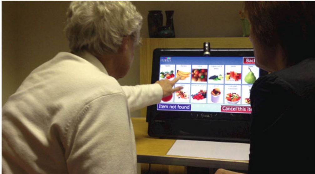
Fig. 11.3 Individuals with dementia testing the NANA application