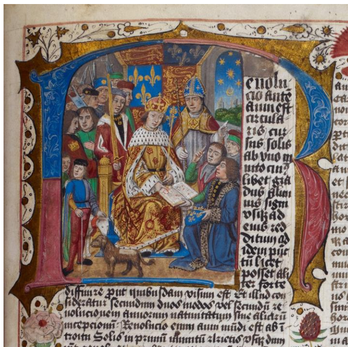
Henry VII being presented with his astrological compendium.

The almanacs grew out of the predictions and forecasts commissioned by the rich and powerful from renowned scientists and holders of university chairs in astronomy. This demand had appeared almost as soon as the new meteorology reached Latin Europe. An early example was that of the astrologer, Guido Bonatti, who advised Guido da Montefeltro (1223-1298) ruler of Urbino, amongst others. Bonatti recorded his trusted techniques in a book which circulated widely in manuscript and went into print very early (in Augsburg, in 1491). This work was divided into six parts, of which one was devoted to astrometeorology. An updated and beautifully illustrated copy was made for King Henry VII of England in 1490 and is now in the British Library.