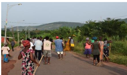
Community members participating in clean-up activities

Activities have included mapping the quantity and quality of water and sanitation services in their communities, with support from the grassroots network Slum Dwellers International and People's Dialogue NGO. The mapping activity build community understanding of which families do not have access to safe water and sanitation services and how many areas are polluted by solid waste. This lead to the recognition of the need for improving sanitation facilities at the household level and the need to learn how to build sustainable sanitation facilities themselves. With the support of the T-GroUP transition team, a design for biogas sustainable toilets was developed and an artisan training for biogas toilet installation was organized in April 2019.