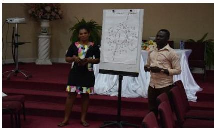
Two community members presenting the results of their mapping activities

The Transition Management approach has been inspiring community members in Dodowa (Ghana) to actively organise in different groups to solve problems related to water, sanitation and waste management in their communities. Since September 2017 the T-GroUP project has been working with communities to support them to set up Transition Experiments, including multiple activities and pilot projects.