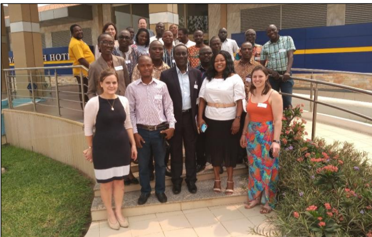
Participants of BRAVE Scenario Planning Workshop, Accra, Ghana.