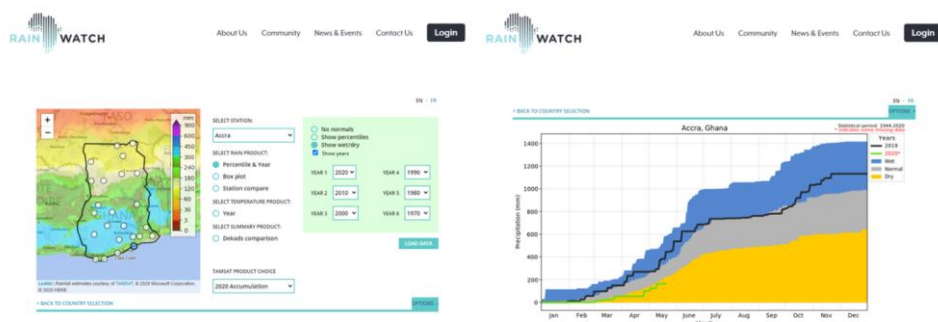
The Rainwatch website interface, showing weather stations in Ghana (left) and cumulative rainfall for Accra for 2019 and 2020 compared to wet, normal and dry years (right).