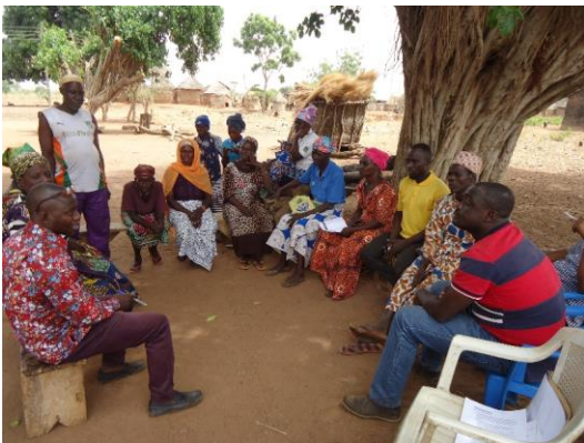
Farmer Voice Radio in action.

https://www.lyf.org.uk/2017/05/community-groundwater-resources-in-ghana-and-burkina-faso/