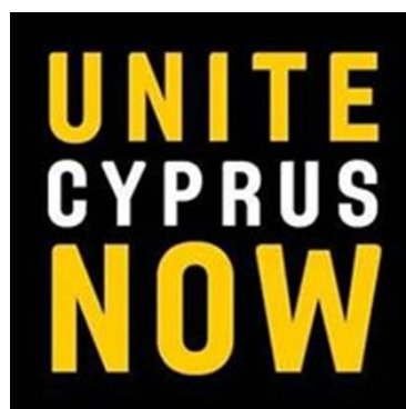
Figure 2: UCN logo.