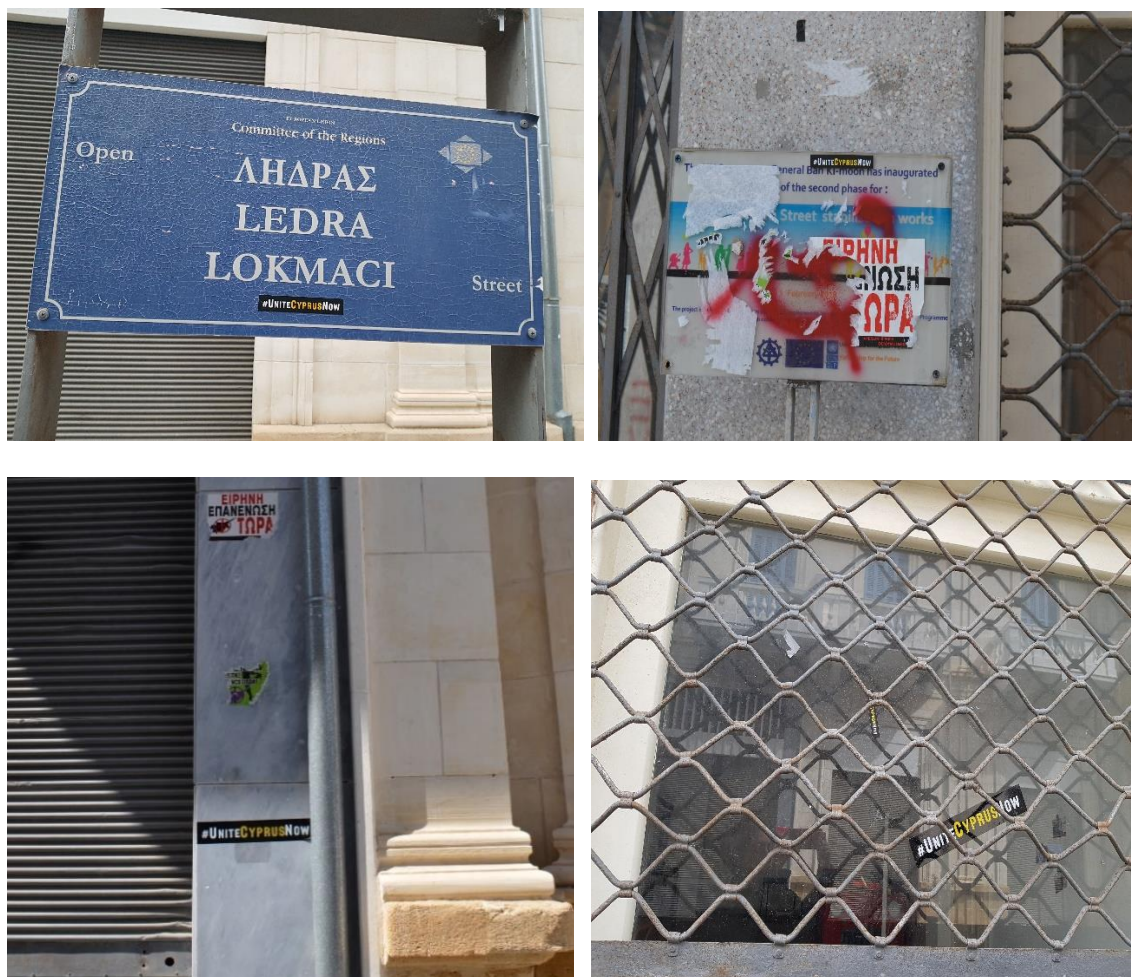
Figure 3: UCN stickers at Ledras/Lockmaci crossing-point in Nicosia's buffer zone (source: Author's ethnographic monitoring 2016-2019)