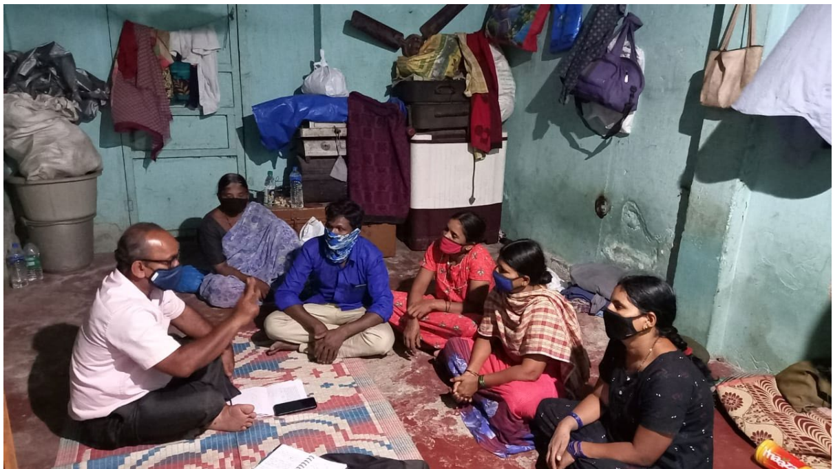
Image 2: Focus Group Discussion with one couple and three female migrant workers from Andhra Pradesh at Udaya Colony, all living together in the room in which this photograph was taken. Photograph taken on 17 March 2021.