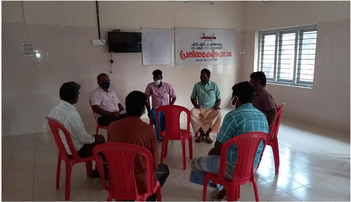
Image 3: Focus Group discussion at Vaathuruthy Colony with male migrant workers from Tamil Nadu. 7 March 2021.